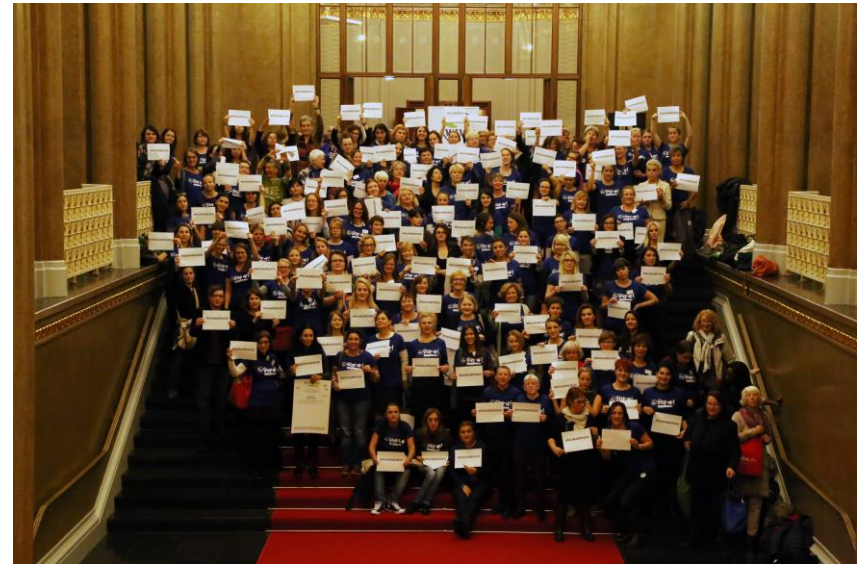
Women participants of the 18 th Annual WAVE Conference, 19-21 October, 2016 Berlin (Germany)

Foundation “United Women” Banja Luka is a member organization of Women Against Violence in Europe (WAVE) Network . Representative of the Foundation “United Women” Banja Luka participated at 18 th Annual WAVE Conference held from 19 to 21 October, 2016 in Berlin (Germany). Focus of the Conference was on implementation of the Istanbul Convention, prevention of femicide, increasing standards in providing services for women survivors of domestic violence, as well as responsibilities of the states to implement the international obligations aimed to protect women from all forms of violence. Participants of the Conference were women activists and practitioners from 36 European countries. Foundation United Women Banja Luka supported “Step Up!” Campaign , as the European-wide initiative launched on 25 May 2016 promoting the rights of women survivors of violence and their children to access support and protection. Launched nationally in WAVE Member countries, and internationally from the WAVE office, this campaign aims to step up efforts in Europe to stop violence against women, raise awareness of the problem, and protect survivors through activities which target different stakeholders and decision-makers.