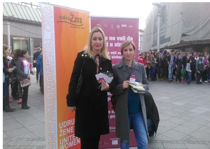
16 Days of Activism Against Gender Based Violence – Activities of the Foundation United Women Banja Luka