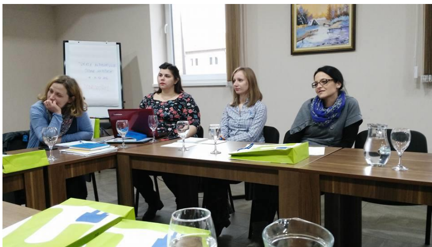
Workshop on Developing Methodology for the Alternative CEDAW Report for Bosnia and Herzegovina 2013 - 2017, organized by the partner organizations the Helsinki Citizens Assembly Banja Luka and Prava za Sve Sarajevo, February 2016, Banja Luka, BiH

In 2016, Foundation United Women Banja Luka continued with activities within the regional initiative of advocating for full implementation of the Council of Europe Convention on Prevention and Combating Violence Against Women and Domestic Violence (Istanbul Convention), as the partner organization to the Autonomous Women's Center from Belgrade (Serbia), Center for Women Victims of War Rosa from Zagreb (Croatia), Gender Equality Council from Skopje (Macedonia), SOS Telephone for Women and Children from Ljubljana (Slovenia), Women's Center from Podgorica (Montenegro), and WAVE Network. At the level of Bosnia and Herzegovina, we advocated for establishing rape crisis centers for victims of sexual violence. We received the information from the Ministry for Human Rights and Refugees of BiH that in upcoming period the institutional mechanisms for gender equality will conduct legal and feasibility study in relation to this obligation from the Istanbul Convention. As a part of 16 Days of Activism Against Gender Based Violence, we joined the regional campaign under slogan "I Do Not Tolerate Violence Against Women" , and advocated for nomination of BiH candidate for GREVIO as the international expert body that monitors implementation of the Istanbul Convention in countries members.