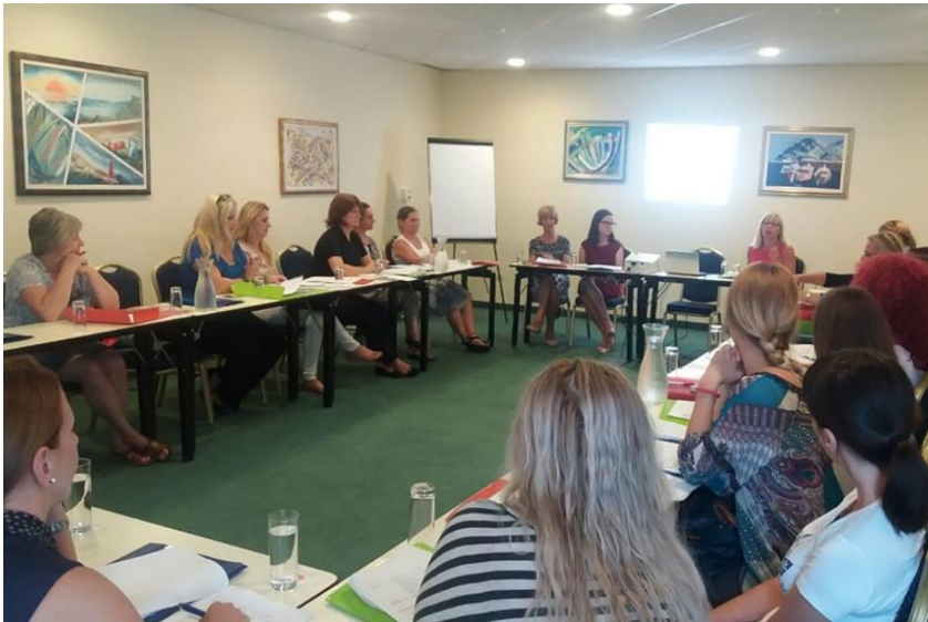
Capacity building workshop for women politicians, August 2016, Neum, BiH

The project activities are creating opportunities for women and men in legislative and executive governance and women CSO activists in BiH to collaborate through the Program Platform 2016 – 2018, work toward advancing women’s rights, increasing influence of women in peace building and stability through decision making at state, entity, and Brčko District levels. During 2016, three (3) thematic workshops were held with participation of hundred and four (104) women and men parliamentarians, representatives of the institutional mechanisms for gender equality at state, entity, and Brcko District levels, and women CSO activists throughout BiH during which key priorities and strategic actions aimed to advance women’s human rights and gender equality were defined at the targeted levels. Additional meetings were held with the parliamentary commissions for gender equality at the state and entity level, to discuss priorities and their support in advocacy actions. Women in decision making and young women politicians had the opportunity to increase knowledge on the international standards for ensuring women’s participation in peace building, decision making, and security, and increased skills in gender sensitive policy making and communication with media.