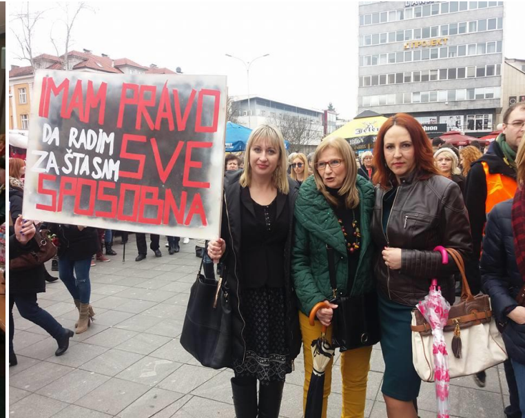
Street March on the International Women's Day, Banja Luka 2016

Representative of the Foundation "United Women" Banja Luka contributed to the work of the Council for Combating Domestic Violence , as the inter-sectoral working body of Republika Srpska Government that supervises implementation of the RS Law on Protection from Domestic Violence.