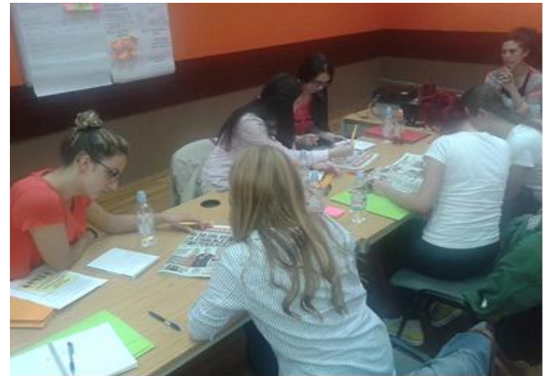
Capacity Building Training on Women's Human Rights for the United Women Banja Luka volunteers