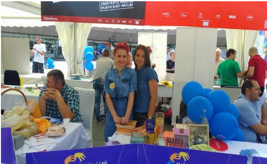
Volunteers of the United Women Banja Luka at the CSO Fair in Banja Luka, July 2016

Support of TRAG Foundation and OAK Foundation also enables the Foundation United Women Banja Luka to enhance networking and cooperation with women's civil society organization working in Bosnia and Herzegovina, Serbia, and Montenegro through participation in joint advocacy, trainings, and workshops. In 2016, United Women Banja Luka improved financial management and fundraising strategies, conducted staff supervision, improved program development, and improved the volunteers' program through capacity building and involvement of volunteers in program activities.