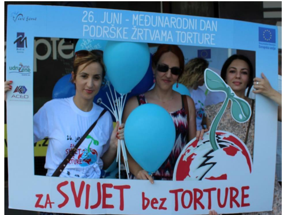
Campaign on 26 June, the International Day of Support for Victims of Torture 2016

In 2016, United Women Banja Luka coordinated development and establishing of two (2) victim/witness support networks in the regions of East Sarajevo and Trebinje. The networks involve women and men professionals from the centers for social work, centers for mental health, judicial institutions, local administrations, as well as CSOs working with victims/witnesses, and representatives of the associations gathering victims/witnesses. Protocol for establishing the Network for the East Sarajevo Region has been signed in February, while two regular meetings of the Network aimed for developing Protocol of mutual cooperation for the Network in region of Bijeljina were held in February and May 2016, resulting with preparing final draft of the Protocol to be signed in the beginning of 2017.