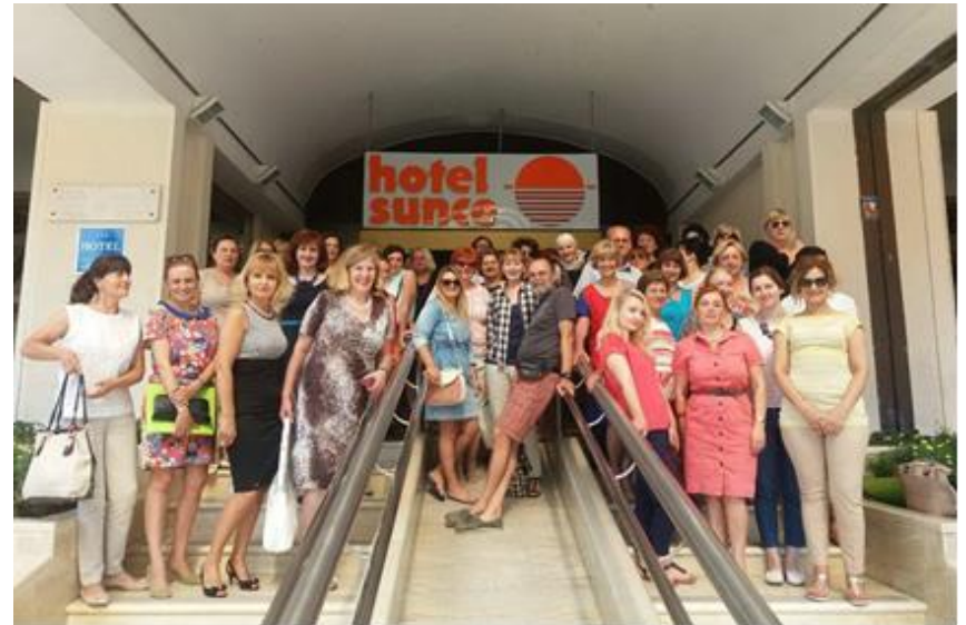
Participants of the Joint Thematic Workshop on Program Platform of Cooperation of Women NGO Activists and Women Parliamentarians 2016 – 2018, Neum BiH