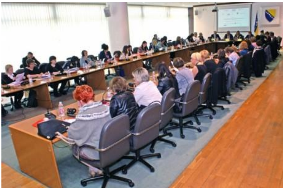
Regional Conference “Cooperation of the Governmental Institutions with Civil Society Organizations with the Objective of Implementation of the Istanbul Convention”, 11 May 2016, Sarajevo, BiH Parliamentary Assembly

In 2016, Foundation „United Women“ Banja Luka continued regional partnership and cooperation with the Autonomous Women’s Center from Belgrade (Serbia), Center for Women Victims of War ROSA Zagreb (Croatia), National Council for Gender Equality Skoplje (Macedonia), Society SOS Telephone for Women and Children Victims of Violence Ljubljana (Slovenia), and VAWE Network (Women Against Violence in Europe) from Austria, on advocacy for implementation of the international standards on preventing and fighting violence against women. As a part of this project, with the support of the European Union through IPA Civil Society Partnership Program, together we work establishing comprehensive legislative solutions and policies for protection of women from violence in the Western Balkans, as condition to reach democracy, securing human rights, social inclusion, and harmonization with the European values. Objective of the project is to strengthen capacities of women’s civil society organizations and networks in four (4) Western Balkan countries, for analysis, monitoring, and advocacy in the area of protecting women from violence through long-term regional cooperation and learning from experiences of the European Union.