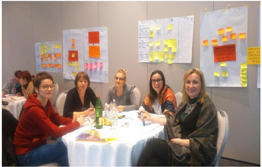
The United Women Banja Luka team members at the training of writing project proposals in accordance with the EU standards, 29 February – 2 March 2016, Zlatibor, Serbia