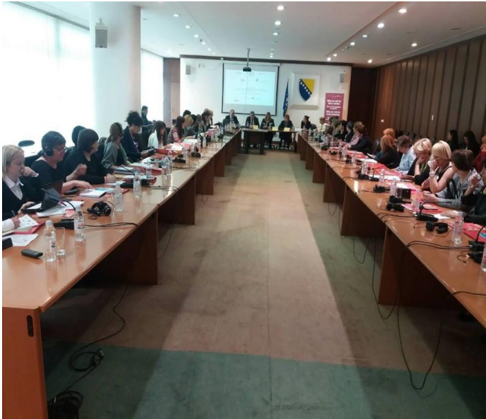
The Conference "Cooperation of Governmental Institutions with Women's Civil Society Organizations on Implementation of the CoE Convention on Prevention and Combating Violence Against Women and Domestic Violence, May 2016, Sarajevo, BiH Parliamentary Assembly