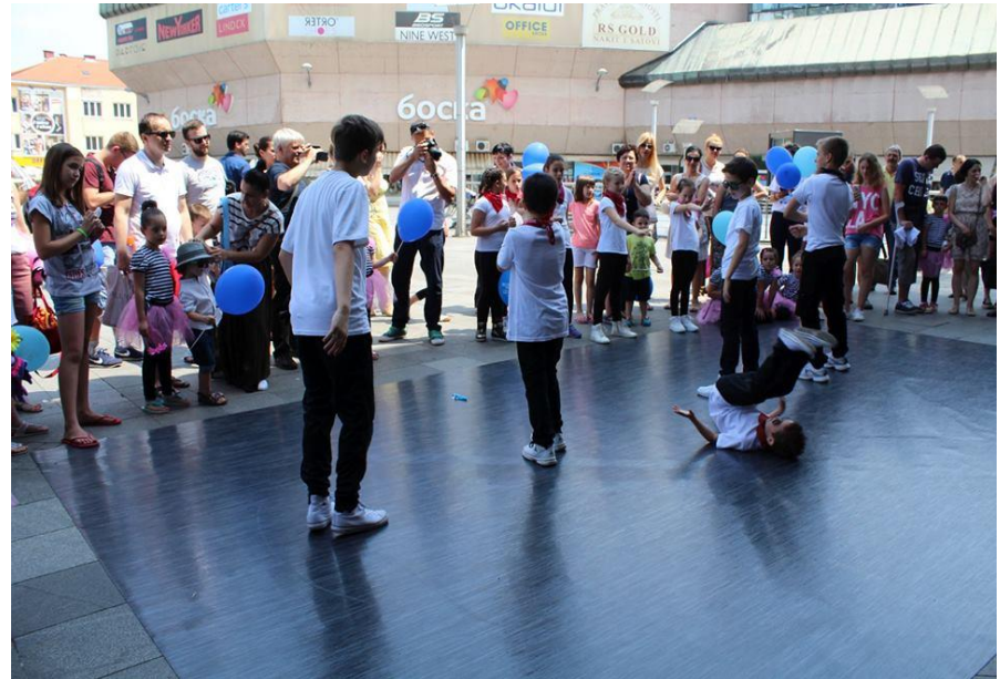
Campaign on 26 June, the International Day of Support for Victims of Torture 2016

We continued to coordinate regular meetings of the Network for region of Banja Luka. Women and men representatives of centres for social work and centres for mental health from 5 local communities in Banja Luka region (Prijedor, Srbac, Čelinac, Laktaši, and Kozarska Dubica) expressed the interest to join the Network for region of Banja Luka, and actively participated in the trainings on psychosocial approach in working with victims/witnesses organized as a part of the project activities. This could potentially increase the access of victims/witnesses in need for assistance and support in the whole Banja Luka region. Additional six (6) regular meetings of multidisciplinary teams were held during June, July, August, and November 2016, and contributed to the increase of cooperation between professionals that provide psychosocial services, as well as support, and understanding of needs for continuous assistance and support to victims/witnesses among policy level stakeholders at targeted levels.