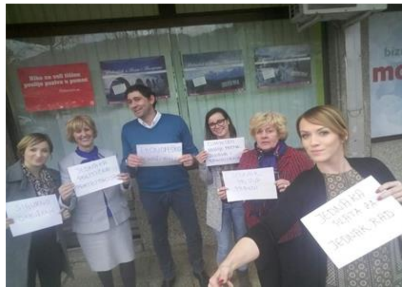
16 Days of Activism Against Gender Based Violence – Activities of the Foundation United Women Banja Luka

The second video clip was produced as a part of the regional campaign "I Do Not Tolerate Violence Against Women" with a focus on raising public awareness on gender based violence against women and girls and public advocacy for implementation of the international standards on prevention and combating violence against women and domestic violence integrated in the Istanbul Convention. The United Women Banja Luka implemented this Campaign together with the local partner organizations in BiH – Foundation Lara Bijeljina, Women's Association Žena BiH Mostar, Prava za Sve Sarajevo, and Citizen's Association Medica Zenica, and regional partners – Autonomous Women's Center from Belgrade (Serbia), Center for Women Rosa from Zagreb (Croatia), Gender Equality Council from Skopje (Macedonia), Women's Center from Podgorica (Montenegro), SOS Telephone for Women and Children