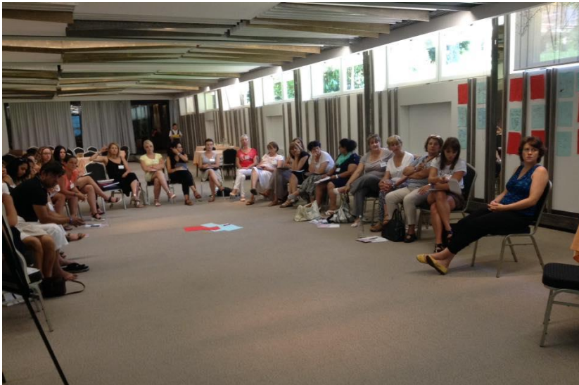
Women NGO Activists from Serbia, Bosnia and Herzegovina and Montenegro at the Fundraising Training, organized by the TRAG Foundation, in partnership with OAK Foundation, 12 to 14 July 2017, Petrovac na Moru, Montenegro