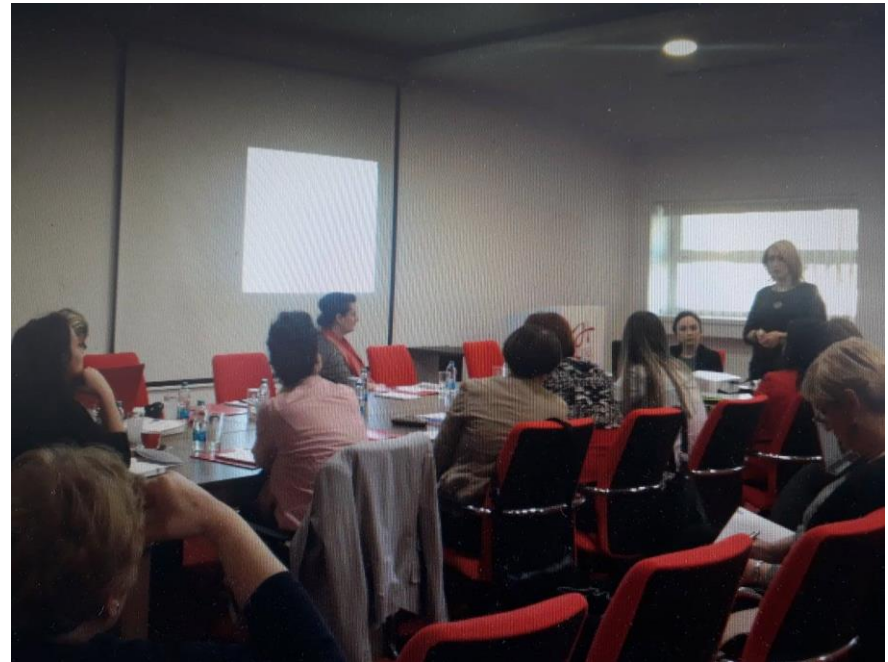
Capacity building workshop for monitors, 30 March – 01 April 2016, Banja Luka

In the period from April to the end of November 2016, together with the Center for Legal Assistance for Women from Zenica, we conducted comprehensive monitoring of the criminal and minor offence proceedings in the area of gender based violence. The monitoring in the Republic of Srpska was conducted in the partnership with the Women's Association Most from Višegrad, the Citizen's Association Budućnost from Modriča, and the Foundation Lara from Bijeljina. It was primary directed on mapping and analyzing the status of protection of rights and recognizing needs of women and children survivors of gender based violence that are appearing as injured persons/witnesses in the judicial proceedings, the penalty policy, and making positive influence on improving procedures and practice of the judicial institutions and other subjects of protection in the area of prevention and combating gender based violence, and contributing to the establishing coordinated and efficient system of protection directed toward support for women and children survivors of violence. The monitoring targeted twelve (12) basic and district courts throughout the RS, and BiH Brčko District.