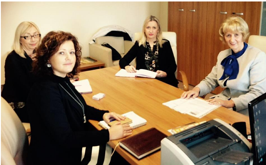
Meeting of the Foundation United Women Banja Luka and women representatives of the Ministry of Family, Youth, and Sport of the Republic of Srpska Government in relation to the financing of the safe houses and access of women and children survivors of domestic violence to the services of support

The Foundation United Women Banja Luka consider important for women to have access to information about their rights , as well as authorities and responsibilities of the public institutions in terms of providing assistance and support for women to exercise their rights in the practice. Trained lawyer and legal assistant of the Foundation United Women Banja Luka are working continuously with women beneficiaries during their stay in the Safe House, and also have regular communication with the women and men professionals from the centers for social work and police to ensure full support for women and children in need.