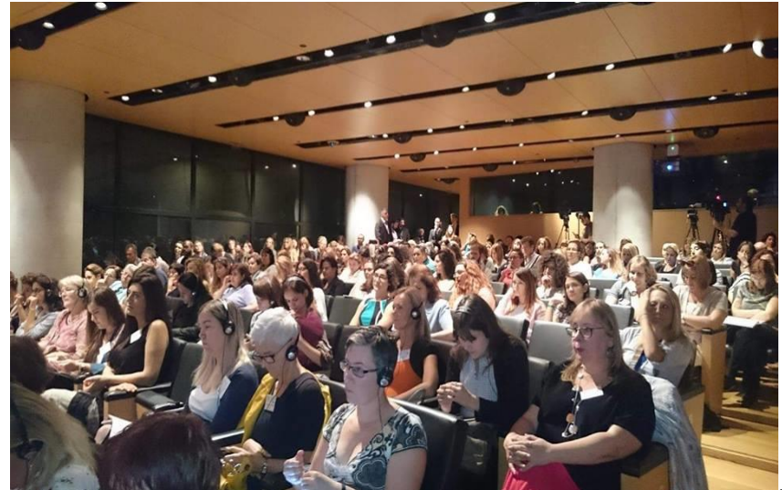
Women participants of the Conference "Building Healthy Intimate Relationships" 22 - 23 September, 2016 in Athens (Greece)

Representative of the Foundation "United Women" Banja Luka participated at the Conference " Building Healthy Intimate Relationships ", organized from 22 to 23 September, 2016 in Athens (Greece) by the European Anti Violence Network (EAWN) and the Smile of the Child. The main aim was to promote the development of healthy and equal relationships between the sexes and the development of zero tolerance towards violence by raising teens' awareness via exclusively experiential and active participation methods. We exchanged experiences with women's NGOs working on providing direct support to women and children survivors of violence and public advocacy for prevention and combating gender based violence.